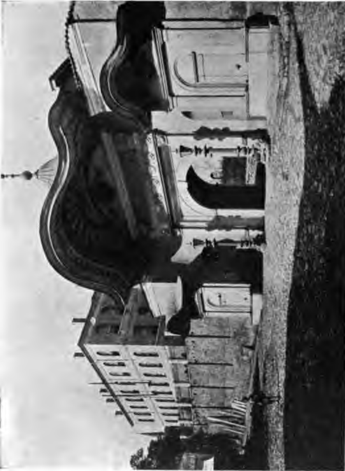
THE SUBLIME PORTE